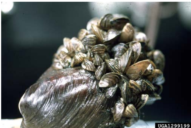
Zebra mussels ( Dreissena polymorpha ) attached to a native clam ( Amblema plicata ).

All KAS members can support the KHLCF by buying a nature license plate at their next renewal; ten dollars goes to the Fund for each plate sold.