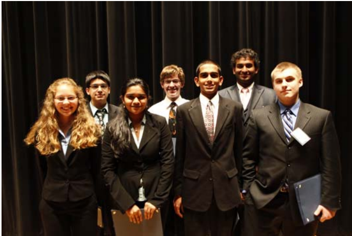
KY-SEF 2011 High School Best of Fair winners