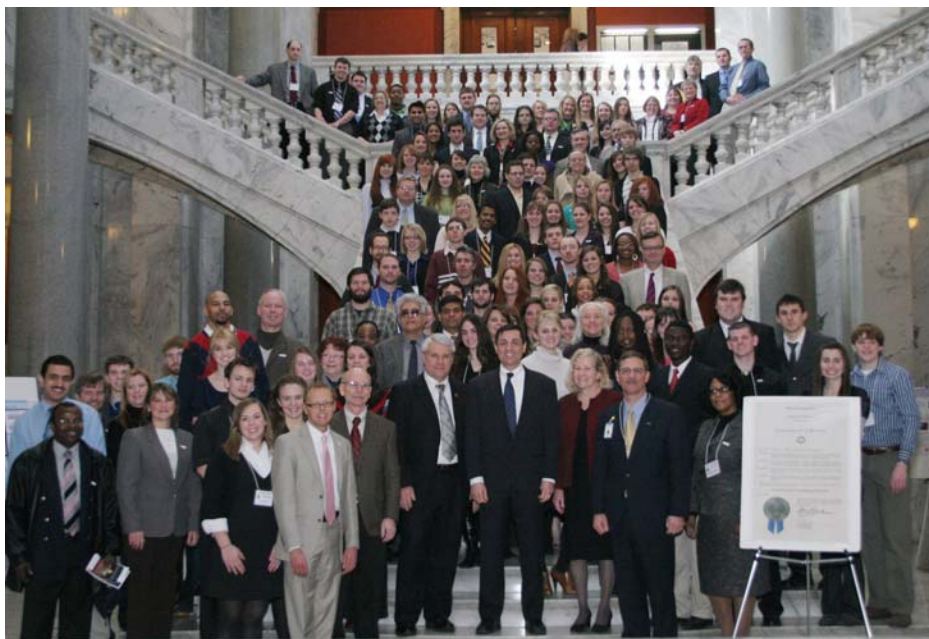
Students and mentors gathered in Frankfort for the Posters-at-the-Capitol 2011 event.

cells. Using the worldwide Protein Data Bank, 5965 proteins that bind zinc were identified and the coordination geometry of each zinc site was classified as tetrahedral, trigonal bipyramidal, or octahedral.