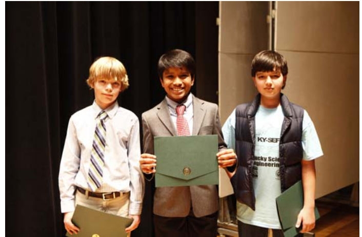
KY-SEF 2011 Middle School Best of Fair winners