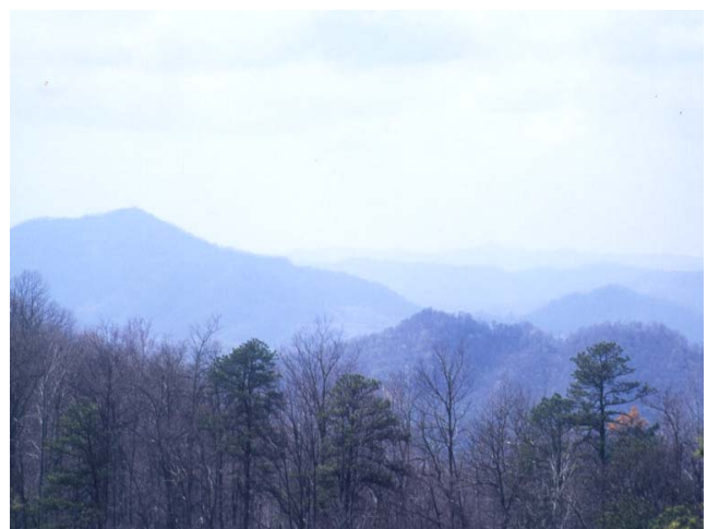
Stone Mountain View