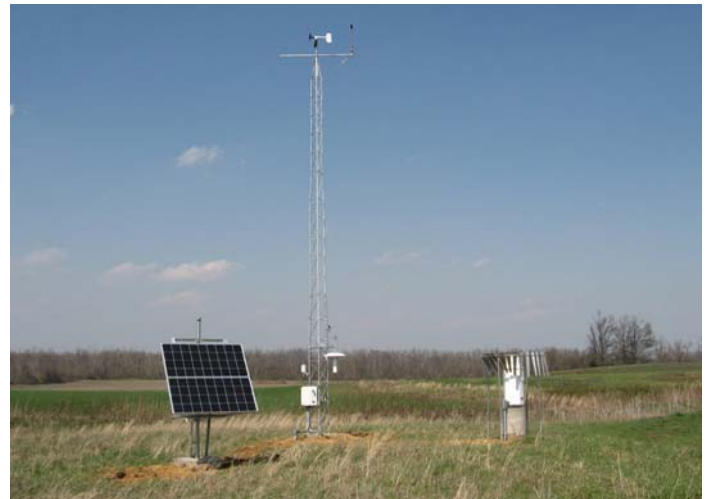
Figure 1. Kentucky Mesonet station on a farm in McLean County.

Much of Kentucky is characterized by complex terrain. Ridges and valleys, varying cover of forest, crop, and grass land, and contrasts between areas of rural and urban development pose significant challenges in Mesonet site identification across large portions of Kentucky. In these instances, priority centers on selecting a site that is broadly representative of the regime where settlement and economic activity are concentrated. Over a larger region where multiple terrain regimes are present, efforts are made to ensure that sites are selected that strategically represent different regimes, following the principal of stratified spatial sampling. Hence, the site selection process has both local and regional components based both on geometrical and terrain considerations.